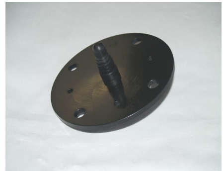
Top & Base Ring