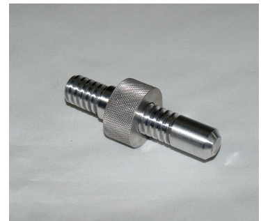
Adj Foot Assembly w/ Jam Nut

NOTE: Tripod Can collapse down to 35" in length