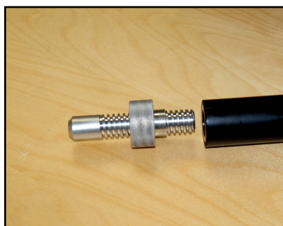
Adjustable Foot w/ Jam Nut screws Into 17" Long 1.5" OD Tube