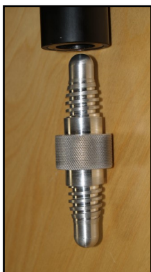
Precision Threaded Pin