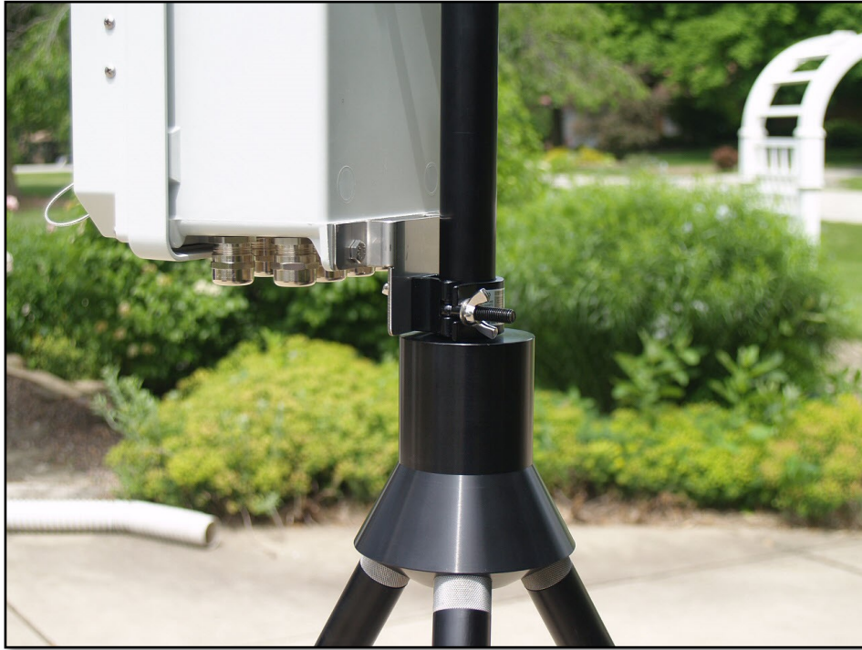
Lower Mounting Bracket for Electronics Enclosure Right on Top of The Center Support