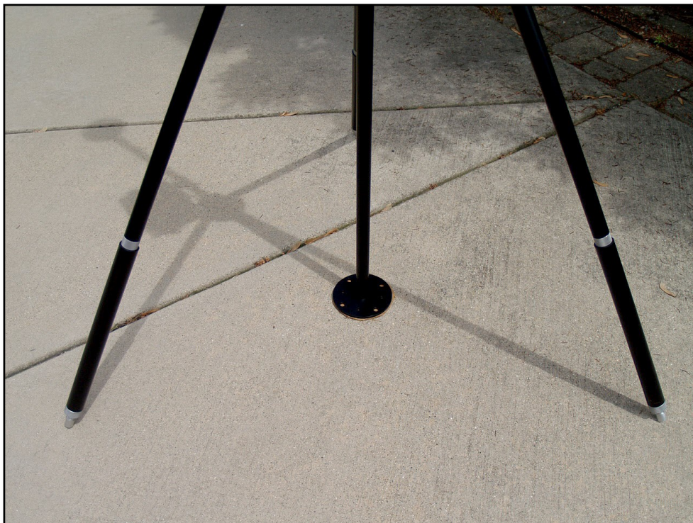
Adj Foot w/ Jam Nut Screws—Shows Bottom Plate Which Needs 1-Stake to Hold It In Place