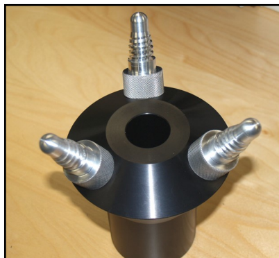
Center Support w/ Pins Inserted