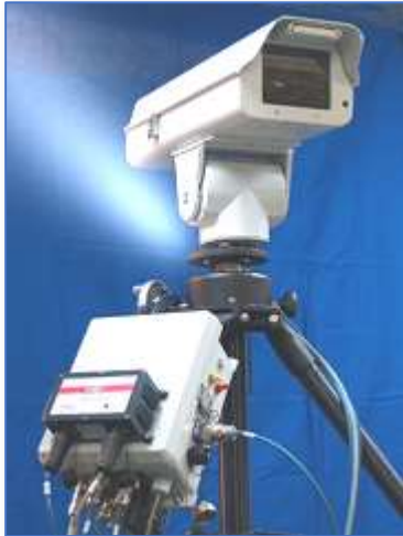
Ad Hoc Video Surveillance System - FBI - Quantico, VA