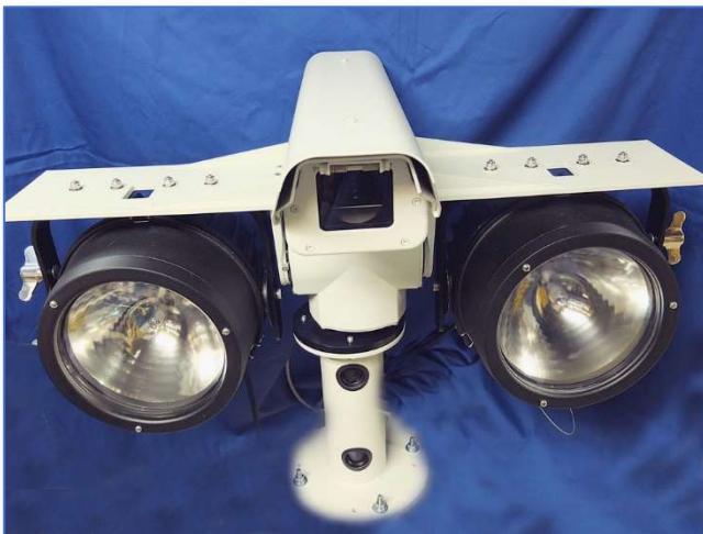
Engineered Steerable Spot Light System Port of Olympia - Olympia, WA