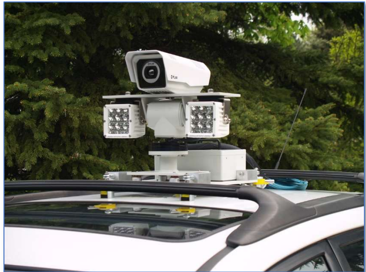
Custom Designed Mobile Mount Thermal Camera System USDA