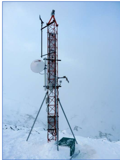
JPTH-13MPoE Positioner on Top of a Weather Instrumentation Tower in the Canadian Rockies - Canada

One example system we supplied was for a wireless, remote weather station in the Canadian Rockies – only accessible by helicopter. The positioner held a camera to both monitor weather as well as avalanche potentials (at the top of the tower in the below image). At this location, the ambient temperatures regularly reached -40F in the winter. The device has worked successfully with no failures for over 10 years.