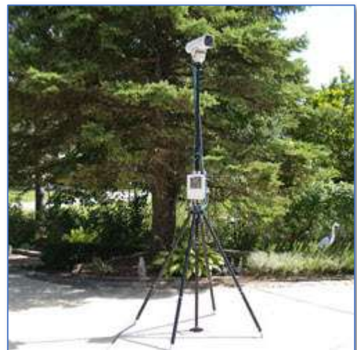
Custom Designed System IP Camera, IP Intercom, Portable Aluminum Tripod and IP Pan Tilt Positioner PoE Powered from a Single CAT5 Cable